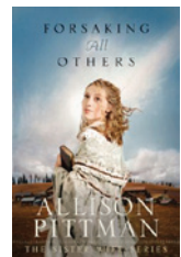
Forsaking All Others

See the full staff reviews: http://bit.ly/bookpicks