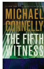
The Fifth Witness